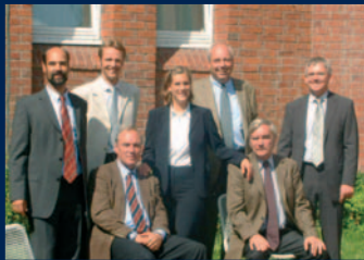
Board of managers of the holding company