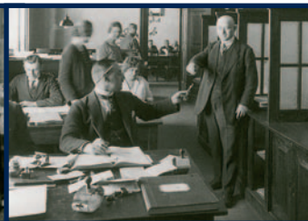
Insurance office about 1926