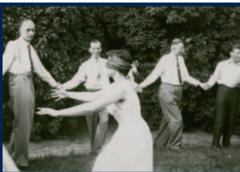
Playing blind man's bluff on a company event 1956

Today, we have partner offices all over in Germany, a widespread network of co-operations abroad and many external experts for special services.