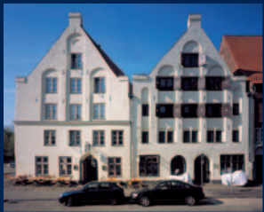
Ancestral seat, Dankwartsgrube

Having a lean company structure with fast decision making processes, MARTENS & PRAHL is in a position to respond speedily to new demands and the individual requirements of their clients. The strength of the group secures a high level of service.